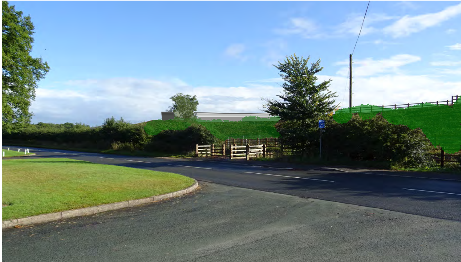
Image 02. Building constructed, embankment planting installed but still relatively low.