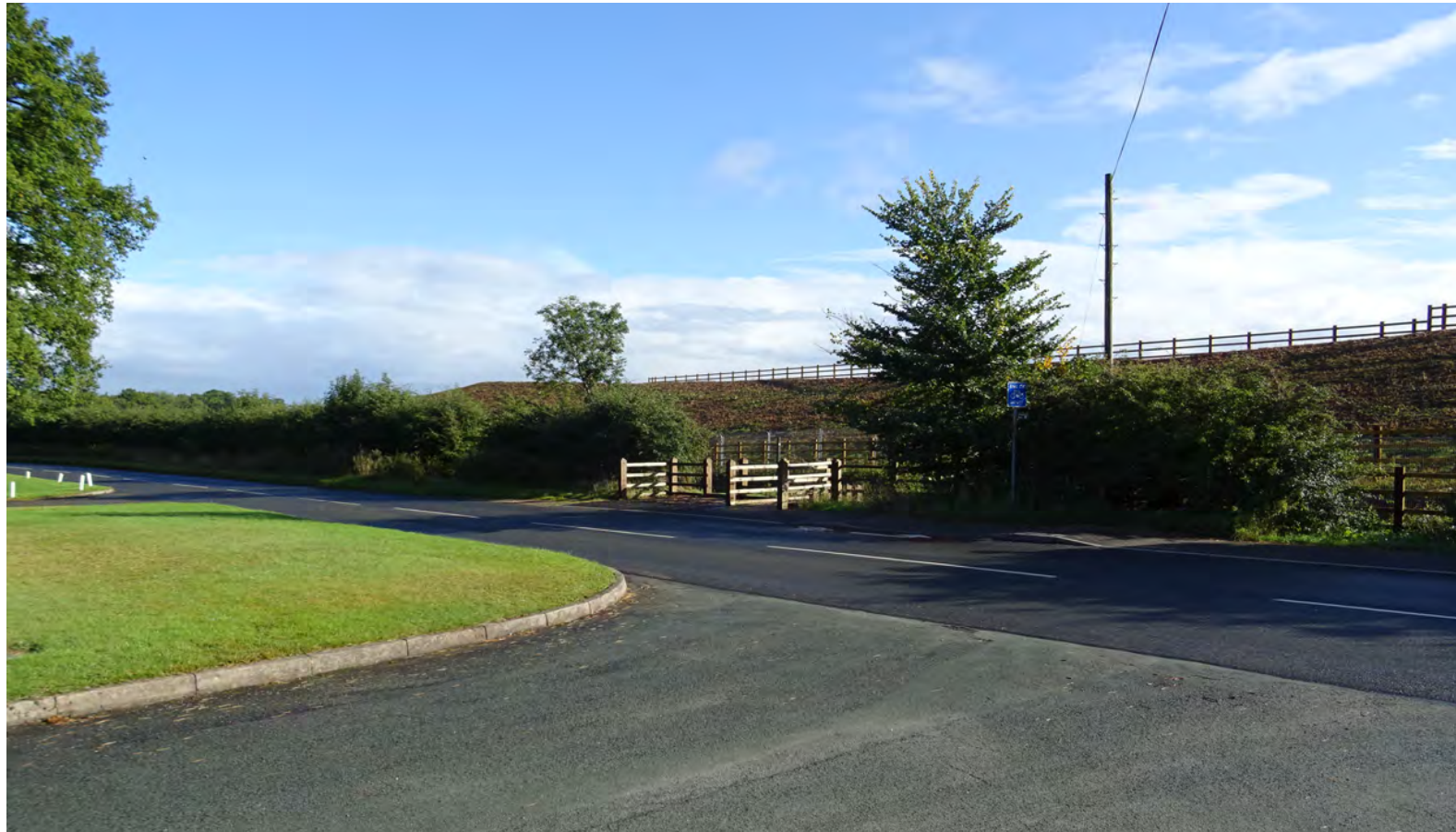
Image 01. Existing view with mound constructed but not yet planted. September 2021.