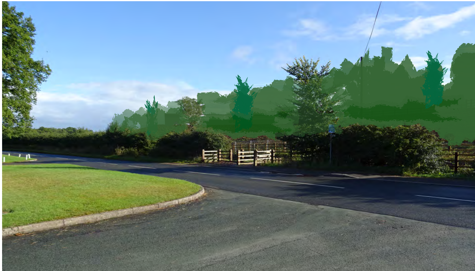
Image 03. Embankment planting well established